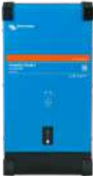
Inverter Smart 12/3000